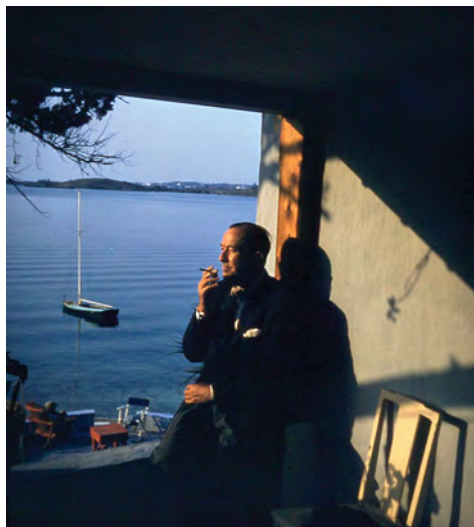
Noël Coward at 'Watergate', Bermuda.

lifetime; his final verse was written only days before he died. Consequently, Coward became known as 'The Master' by many of his contemporaries and fans.