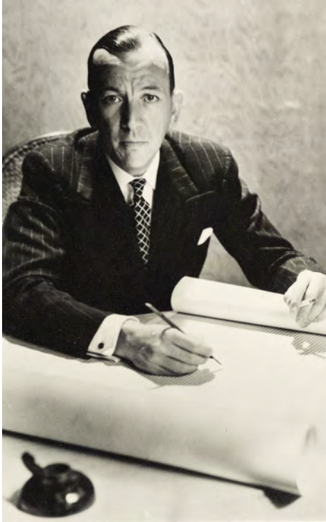
Noël Coward at his writing desk

Born in 1899, Noël Coward was raised as a working class boy in the London suburb of Teddington. His father was an unsuccessful piano salesman and was said to have little personal ambition, often resulting in poor family finances.