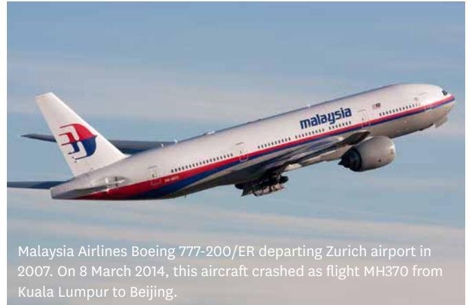
Malaysia Airlines Boeing 777-200/ER departing Zurich airport in 2007. On 8 March 2014, this aircraft crashed as flight MH370 from Kuala Lumpur to Beijing.

The renewed search for MH370 began in January 2018 after the US-based company Ocean Infinity was hired by the Malaysian government, but had not yet found anything in March 2018.