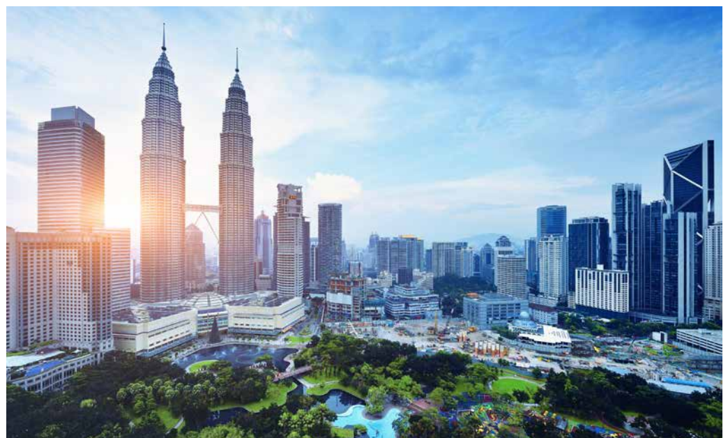
Kuala Lumpur, Malaysia

Sources: Malaysia: History on lonelyplanet.com; 1MDB: The case that has riveted Malaysia on bbc.com