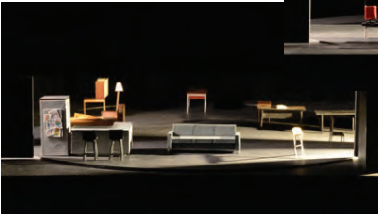
Set Model by Shaun Gurton. Clockwise from top left: Act 1, Sc 6 Macbeth Kitchen; Act 3, Sc 2 Macbeth Bedroom; Act 4, Sc 3 Macduff House.

With the many locations in the play, Shaun has incorporated a revolve into his design. In addition to allowing a smooth transition between scenes, the revolve supports the overall rhythm of the production: