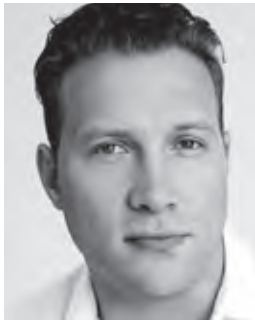
Jai Courtney Macbeth