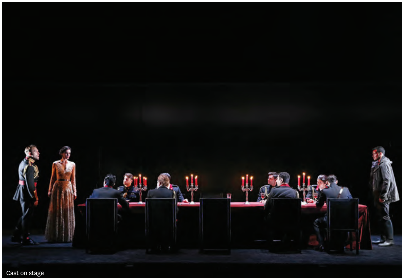
Cast on stage

Discuss Lachlan’s idea that the democratic institutions we have in place to stop tyranny are susceptible to human weakness.