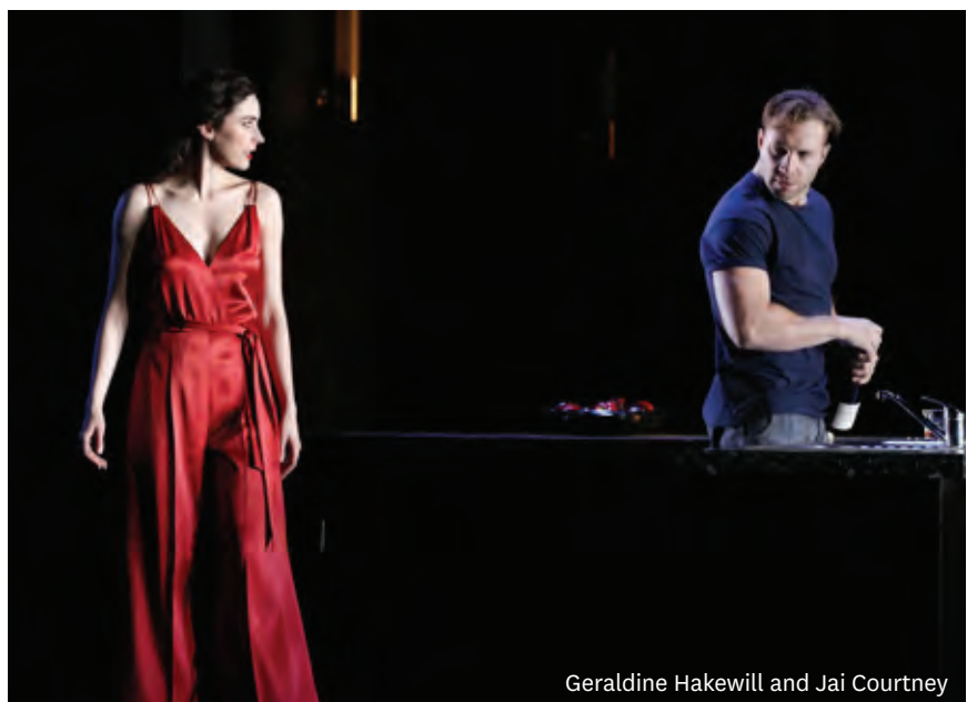
Geraldine Hakewill and Jai Courtney