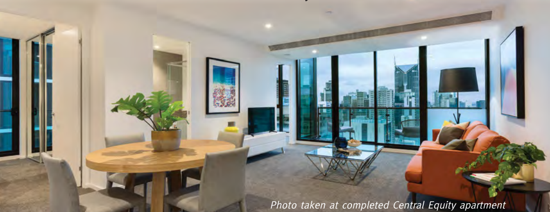
Photo taken at completed Central Equity apartment