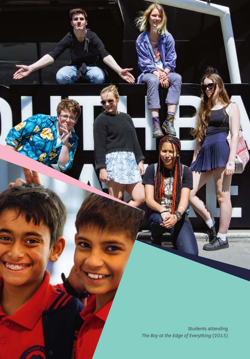
Students attending The Boy at the Edge of Everything (2015)