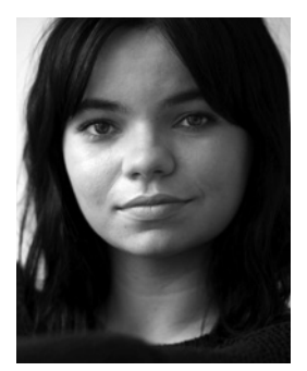
Zoe Terakes Emmy